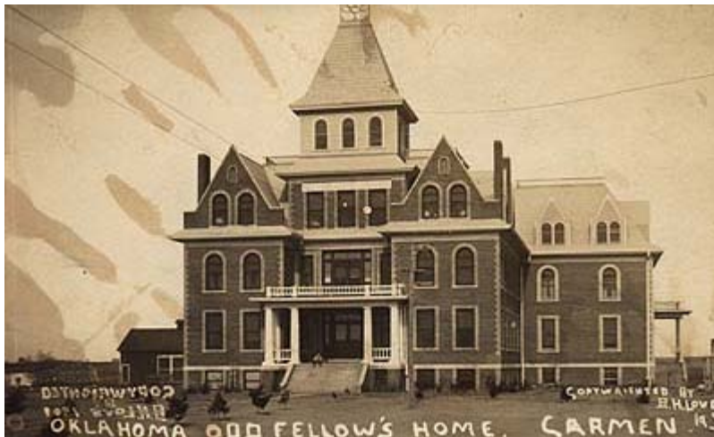
Oklahoma Odd Fellow's Home, Carmen, Oklahoma.

After that the Pentacostal Holiness Church purchased it around 1944 and made it into the Carmen Home for Elderly in 1954.